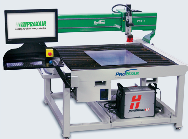
PRS4 CNC Cutting System