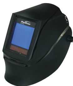
Variable Shade Black Helmet 4-1/2" X 5-1/4", Shade 5-14 PRS61900