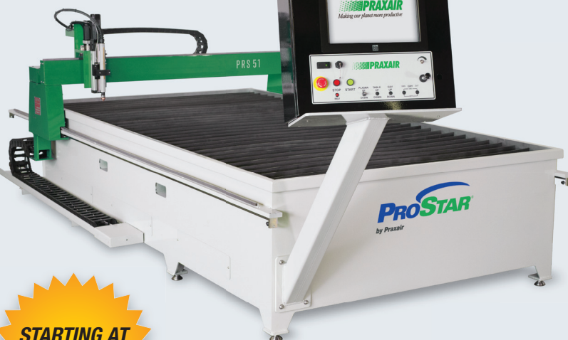
PRS51 CNC Cutting System