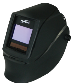
Fixed Shade 10 Helmet 2" X 4-1/4" PRS61510

High-Quality Digital Or Analog Filtering Solar Powered And Battery Backup-Always "On" And Ready to Weld!