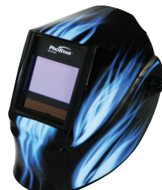
Variable Shade Blue Frame Helmet 4-1/2" X 5-1/4", Shade 5-14 PRS61901