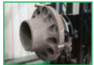
Optional Tailstock system available for adding flanges or end caps.