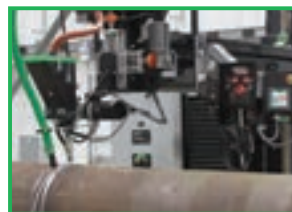
Available with fully integrated subarc manipulator or robotic welding systems.