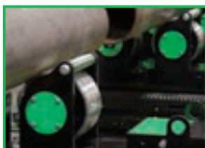
Pipe loaded, lined up using track drive.