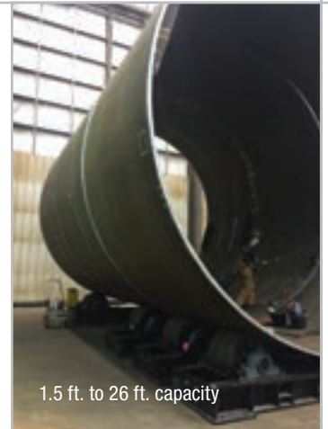
1.5 ft. to 26 ft. capacity

PR5FSFR Forward/Reverse Heavy-duty cast steel body with heavy-duty guard/handle and heavy rubber 25 ft. cable with 4-pin metal plug.