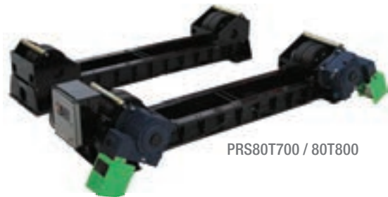
PR80T700 / 80T800

ProStar turning rolls have a large diameter range and are built to rugged specifications. Driveshaft-free dual drives with synchronized rotation provide excellent traction and control. For high vessel fabrication productivity, put to use in combination with the ProStar column and boom manipulator or robotic welder with gantry.