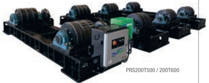
PR200T500 / 200T600